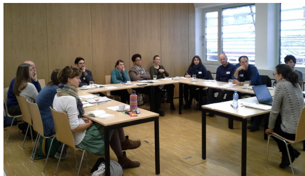
Figure 1. Workshop participants listening to a lecture given by a senior researcher.

the above-mentioned content and discussed their research projects of which all included stakeholders. Furthermore, they came up with several recommendations for improving higher education on inter- and transdisciplinary research in Austria.