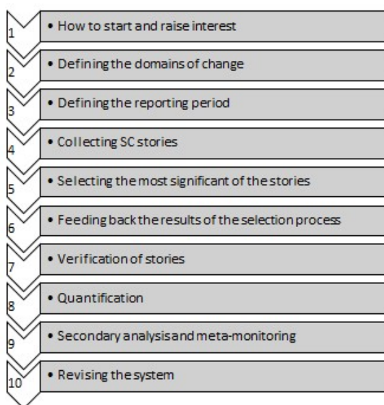
Figure 1: Overview of what a "full" implementation of MSC might look like (DAVIES & DART, p.10) [15]

These two stages raised our interest in the MSC. There are multiple reasons for this choice, but two considerations are especially relevant. The first is that the narrative approach of MSC fits our research and educational orientation, which is not focused on a set of predefined learning outcomes but uses the lived experiences of participants in an intervention as a starting point to study the impact of an intervention. The second reason is that MSC combines descriptive and evaluative analysis. The method is used to describe the experienced changes due to a certain intervention but also explicitly invites stakeholders to value these changes, in turn enabling a discussion about the values that are at stake in an organization or intervention program and adding more depth to an evaluation. In the words of DAVIES and DART: "It [MSC] is a good way to clearly identify the values that prevail in an organization and to have a practical discussion about which of those values are the most important" (p.12). [16]