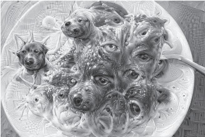
[Figure 1.2.] A plate of spaghetti meatballs returning our gaze.

Inceptionism gives those forces a face—or more precisely unlimited eyes. The creature that stares at you from your plate of meatballs is not an amphibian beagle, though. It is the ubiquitous surveillance of networked image production, a type of memetically modified intelligence that watches you in the form of the lunch that you will Instagram in a second if it doesn't attack you first.