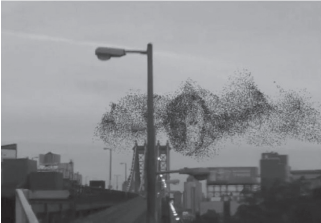
[Figure 1.3.] The shape in this flock of birds over New York appears to be the face of President Vladimir Putin. [Screenshot of video by Sheryl Gilbert, available at: https://www.youtube.com/watch?v=h-7-Ej_Nulg , accessed August 1, 2018.]

game was successful if a machine had the same ability as a human to confuse an interrogator about its gender. But contemporary computation is not about confusion of identity but multiplication of identities. Facebook, for example, has modified the imitation game to say: if you don't want to identify as man or as woman that's fine, but please check one of these fifty-plus boxes to state your precisely defined other type of gender, and we'll make sure to send you the appropriate adds. This is not an imitation game but an identification game.