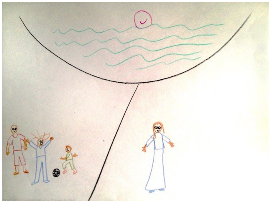
Figure 2: "This is what everyone thinks I do and this is what I do." Representation of self as doctoral student and mother (Drawing by DocMama2) [42]

After the first interview, I moved on to a differing experience with DocMama2, a social sciences major who was married with one child and pregnant with a second. Instead of speaking in metaphors and at length like DocMama1, DocMama2 concisely noted her experience of becoming a mother while in her doctoral program within only a few minutes. While I asked follow-up questions, which were all answered succinctly, the feeling of the overall interview changed once she had a chance to draw a picture (see Figure 2).