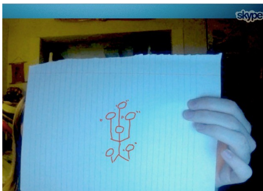
Figure 3: Spinning plates. Representation of being a doctoral student mother (Drawing by DocMama3) [47]

The first interview with DocMama3, a science major who lived out of town with her young child, I conducted via Skype. This meant that instead of being able to arrange a space allowing for quiet discussion with paper and colors available, I had to rely on the participant's ability to create a space that was conducive for interviewing. The timing was arranged easily and plans for the interview and coloring were made. However, the quiet space and access to coloring materials was not as simple as we had both anticipated. Ultimately, DocMama3 participated in the interview in the living room of her parent's home while her father worked to take care of her toddler who often came into the living room. For the drawing part of the interview, DocMama3 quickly found a piece of lined paper and a pen (see Figure 3).