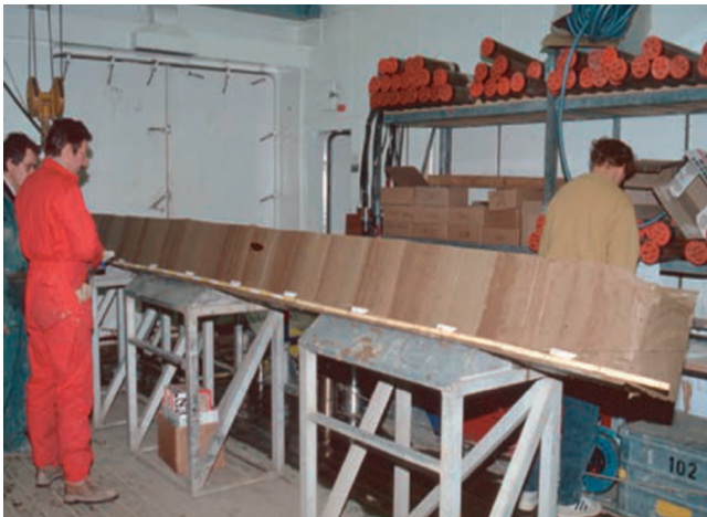
Fig. 6. “Kastenlot” from the central Arctic Ocean and acquired by research vessel POLARSTERN (long and large volume box corer developed by the marine geology group of GPI).

The scientific thrust of the marine geology group at the GPI changed considerably during the late 1960s and early 1970s. Attention turned to the continental margins off Western Europe and Northwest Africa and various deep-sea basins, as well as to marine non-living resources (von Rad et al., 1982). A number of METEOR expeditions were organized to study sedimentation patterns and processes along profiles across the shelves and adjacent slope regions, primarily off the Iberian Peninsula and Northwest Africa. Again, geophysical data and sediment distributions were investigated relating them