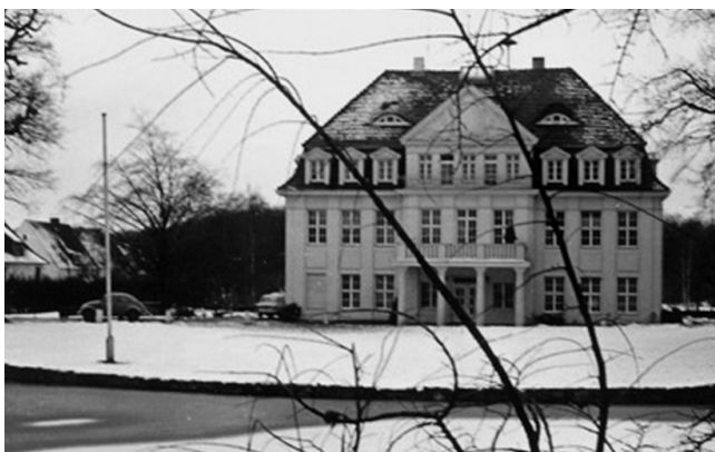
Fig. 2. The old “mansion” in Stift which housed working groups on marine micropaleontology for many years, until the new GPI was built on the university campus 1964–1966 (cf. Figs 3a–b).

disciplines through existing staff, thereby maintaining the scientific breadth of the institute. Seibold also became the first dean of the newly founded Faculty of Natural Sciences (1963) of CAU, no small achievement after he had arrived in Kiel only five years before.