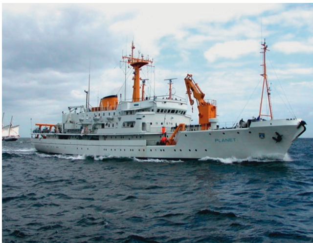
Fig. 11a. The first RV PLANET of FWG, launched in 1967.

The FWG soon gained national and international reputation because of its sophisticated scientific and technical structure. In 2004, its original research vessel PLANET which had been launched in 1967 was replaced by a highly advanced new PLANET. The new ship is a large twin hull vessel with very quiet seagoing properties up to high sea states. Both vessels (figs. 11a–b) operated in the Baltic and North Seas as well as in the North Atlantic and Mediterra-