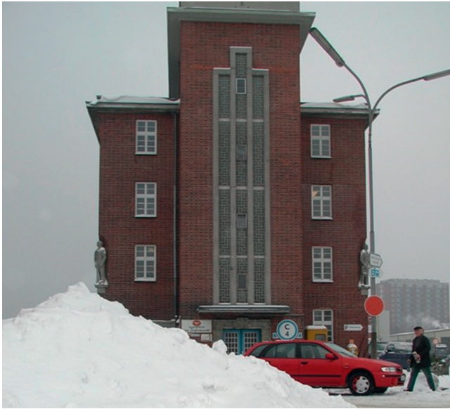
Fig. 7. First premises of the GEOMAR Research Center for Marine Geosciences at the CAU in the area of the old fish market (“Seefischmarkt”) on the eastern shore of “Kieler Förde”. The first GEOMAR offices were established in the pictured building no. 4.

paleoclimatic research (Hay, 2016). He had been involved in the ocean drilling programs since their inception and had served on a number of JOIDES Panels and its Planning and Executive Committee for the DSDP and IPOD.