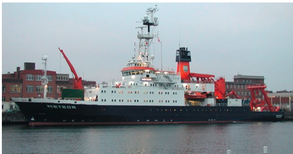
Fig. 9. The youngest METEOR built in the early 1980s on the pier of GEOMAR. The new METEOR was used many times during the SFB 313 in the Norwegian-Greenland Sea.

highest scientific review committee with members appointed by its president) evaluated the plans and recommended for GEOMAR to start as an independent research institution, but linked to the university and funded entirely through the local government. Since many of the employees at GEOMAR were from foreign institutions where research work was mostly supported through soft money, GEOMAR was following that route, too. Soon its budget was augmented through the acquisition of substantial external funds, allowing it to hire many motivated young scientists (cf. fig. 5) and to buy sophisticated equipment for its labs. The early fast growth of GEOMAR was achieved using a combination of 25% local permanent funds and 75% soft money. This allowed for substantial flexibility.