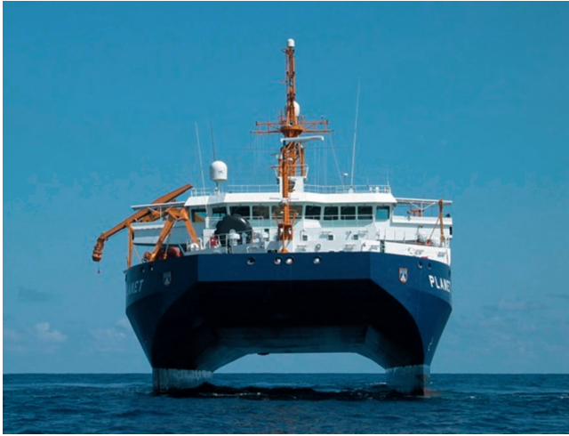
Fig. 11b. The second RV PLANET of FWG, launched in 2004.