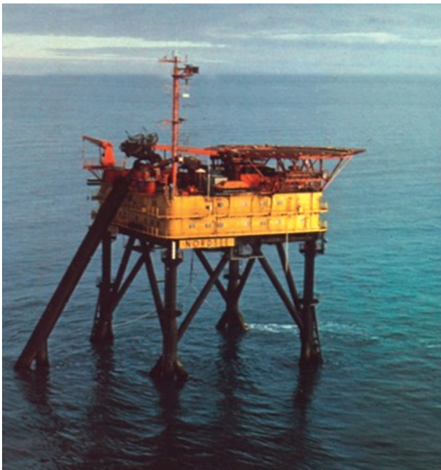
Fig. 11c. The North Sea Platform (NSP) of FWG 1975–1993.

nean. The cooperation between the seagoing working groups of the universities and FWG was to the benefit of both sides. In particular, the new PLANET with its very low self-noise and seagoing up to high sea states is also useful in mitigating the damaging effects of underwater noise on the behaviour/fate of marine mammals while conducting experiments.