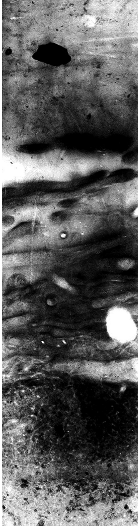
Fig. 4. Radiography of a box core slice from the Vöring Plateau (one of the central working areas of the SFB 313) with clear indications of the occurrence of IRD (ice-rafted debris) and well developed biogenic sediment structures. Width of the box core slice approx.. 5 cm.