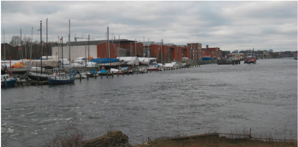
Fig. 8. Main location of the new GEOMAR in the “Seefischmarkt” area in eastern Kiel. The attraction of the location was a long pier where research vessels can dock (cf. fig. 9), old buildings which after renovation could be taken into use right away and sufficient space to plan for new buildings. The complex of brick-buildings in the center is the new lab facility which has been erected in the early 1990s.

While attempting to join the ranks of the so-called “Blaue Liste” (institutions funded in equal shares by the local and the federal governments) from the very beginning, the German “Wissenschaftsrat” (the Federal Republic’s