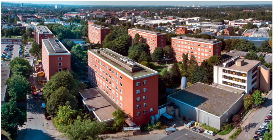
Fig. 3b. Picture of the “Angerbauten” in the Ludewig-Meyn-Strasse of the CAU campus which had been built in the mid-sixties, but which will be demolished in the near future because of constructional deficiencies. The new GPI (from 1967 onwards) as part of the “Angerbauten” is located on the far left corner of this group of buildings. The art of the building was modest at that time with the result that a decision has been reached in 2015 to demolish it and to plan for a new building, also as part of the CAU campus, but at some distance to this location.

One of the other relatively early investments was the development of a sophisticated sediment balance by Eckart Walger to measure hydraulic grain sizes and of a flume channel (installed in the new building) soon used for experiments on the erodibility of sediment surfaces (cf. paragraphs on SFB 95 further below; Einsele et al., 1974). Another example of the introduction of new techniques was the preparation of radiographs of well-prepared sediment slices collected from the large volume box cores which allowed to study mechanical and biogenic sediment structures in great detail. This ac-