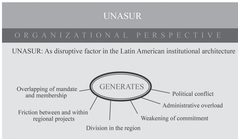
Figure 1: UNASUR – Organisational perspective

As to the Latin American spaghetti bowl, both the proliferation and the overlapping of regional organisations, as well the possible consequences thereof, have been broadly discussed. One group of analysts – best represented by Malamud and Gardini (2012) – take a very critical view of this. They state that ‘the presence of segmented and overlapping regionalist projects is not a manifestation of successful integration but, on the contrary, signals the exhaustion of its potential’ (Malamud and Gardini 2012: 117). In their opinion, the multiple memberships of states in different (sub)regional organisations will invariably create friction between and within regional integration projects – and thus will ultimately fuel division instead of unity in the region. Moreover, as Gómez-Mera (2015: 20) indicates, ‘by introducing legal fragmentation and rule ambiguity, regime complexity has exacerbated implementation and compliance problems in Latin American regional cooperation initiatives.’