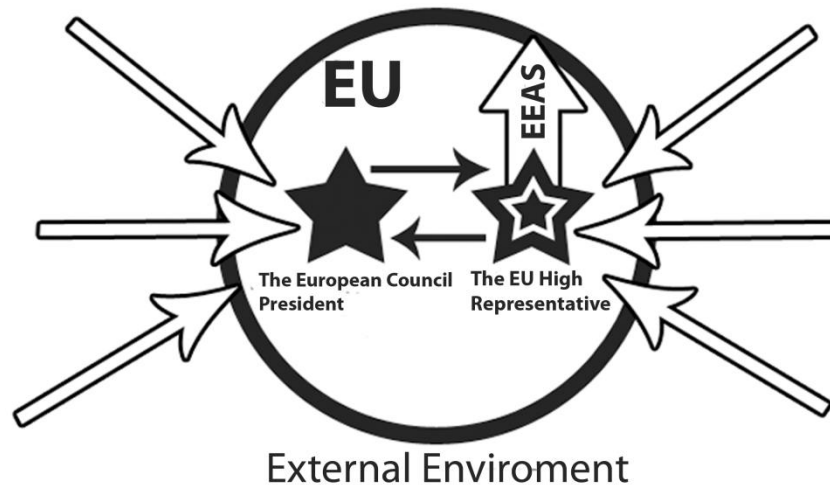
Figure 2: “Diarchy”

Furthermore, characteristic of the Lisbon Treaty within the CFSP are indeed the key political institutions provided by it, i.e. the President of the European Council and the High Representative, as well as the commitments for creating a defence mechanism with a specific, sui generis nature (embodied in the PSC and the EDA). By the installation of these institutions, this Treaty strives to enable Europe to speak with one voice and with one mouth in international affairs as a precondition for its establishment as a global actor. However, this attempt has been reduced through “diarchy” or “intrinsic dualism” (Wessels and Bopp 2008, 29), because both institutions, as the President of the European Council and the High Representative, have been assigned responsibility for representing the Union in international relations (Figure 2.).