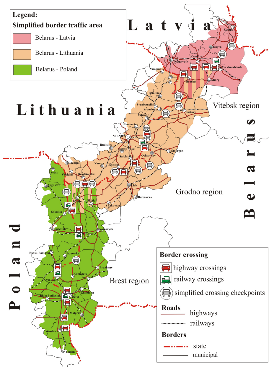
Fig. 1. Local border traffic area at the border of the Republic Belarus and the neighbouring countries