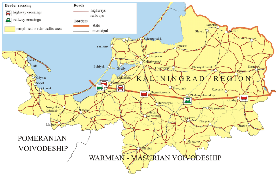
Fig. 4. Local border traffic area between the Russian Federation and the Republic of Poland