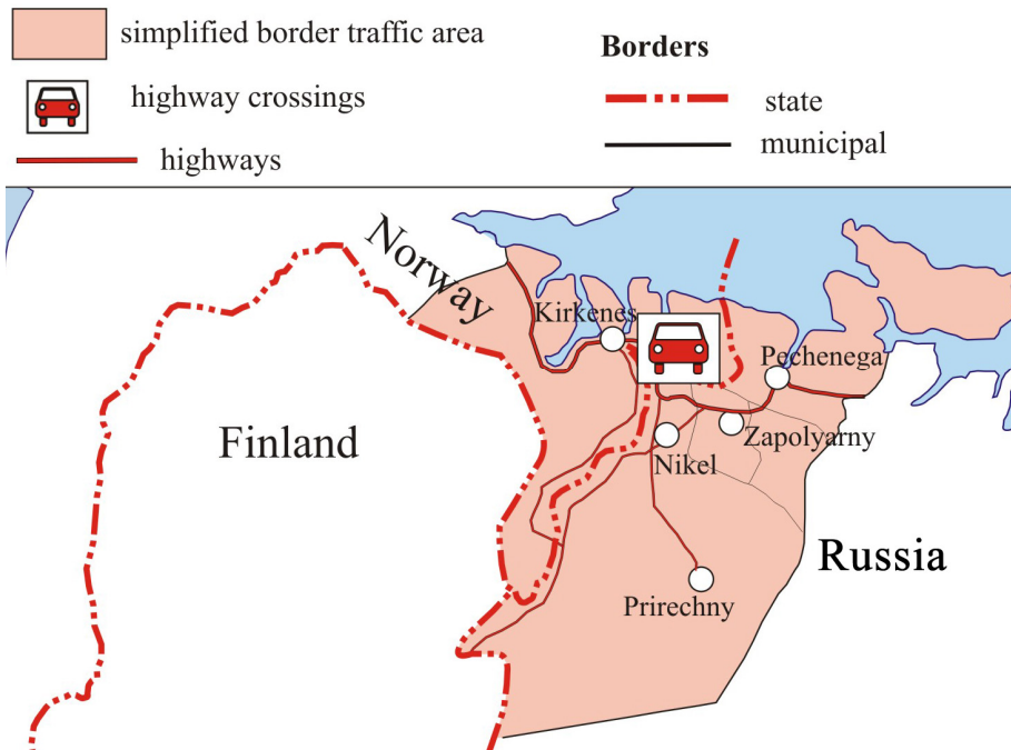
Fig. 2. The local border traffic area between the Russian Federation and the Kingdom of Norway

The agreement between the Government of the Russian Federation and the Government of the Kingdom of Norway on mutual travel of residents of Russian and Norwegian borderlands was signed on November 2, 2010. [31] It came into force only in May 29, 2012. This agreement covers border territories on either side of a 196 km border. In Russia, it includes municipalities of the Pechenga district of the Murmansk region within a 30 km border area (Nikel, Pechenga, Zapolyarny, and Korzunovo). In Norway, it is the border municipalities of the Finnmark fylke 3 (its Sør-Varanger municipality borders on Russia) (fig. 2).