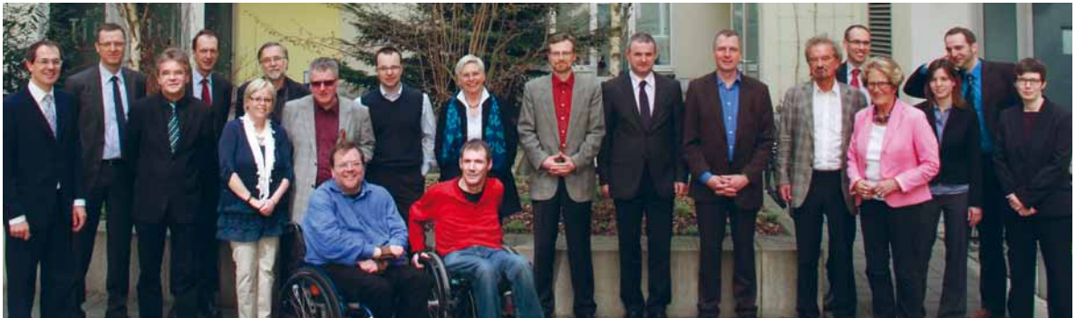
3 rd meeting of the Monitoring Body with disabilities representatives from the federal and state governments in April 2013.

The National CRPD Monitoring Body keeps close watch on the implementation of the United Nations Convention on the Rights of Persons with Disabilities (CRPD). It issues reasoned expert opinions in court and legislative procedures, advises government authorities, carries out applied research and organizes events dealing with the Convention.