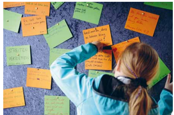
Strengthening children's rights and co-determination. Girls on International Children's Day in Cologne.

There are still many deficits in the implementation of children's rights. Putting 16 and 17-year-olds into custody pending deportation is just one example of many. A comprehensive and systematic revision of the compatibility of German law with the CRC is therefore urgently needed. The United Nations Committee on the Rights of the Child has recommended the establishment of an independent body for monitoring the Convention's imple-