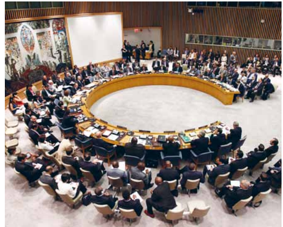
The UN Security Council deliberates on the humanitarian situation in Syria, August 2012.

Closer cooperation is important because the two organs often work largely independently of each other on the same country. The Human Rights Council frequently sends experts to a country with which the Security Council is also concerned. How can the information gathered by them be communicated more quickly and more systematically to the Security Council? Such cooperation could help the Security Council to take faster action in cases of severe human rights