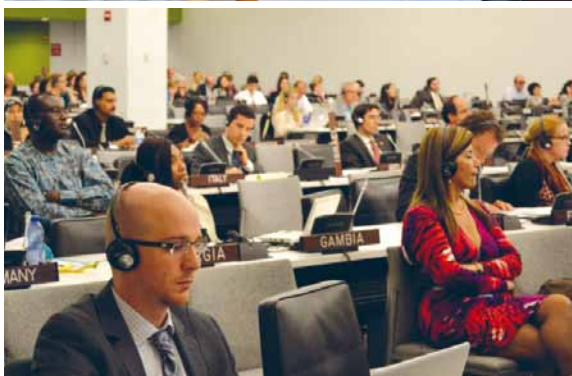
Meeting of the UN Open-ended Working Group on Ageing in New York in 2012.