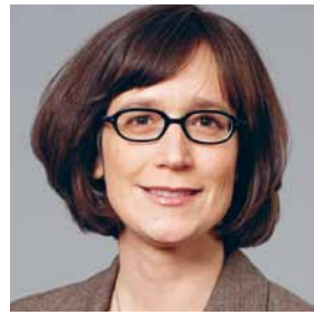
Dr. Petra Follmar-Otto heads the Department of Human Rights Policies Germany / Europe

We only express ourselves in proceedings that raise a structural human rights problem, above and beyond the case at hand. A further criterion is that the case has to deal with a pressing human rights concern, one that involves topics or regulations for which Germany has been repeatedly criticised by international human rights bodies and on which no changes have taken place. One example is benefits under the Asylum Seekers' Benefits Act. The United Nations Committee on Economic, Social and Cultural Rights has recommended three times in a row that the legal provisions for lower benefits and benefits in kind for asylum seekers be revoked. In the proceedings before the German Federal Constitutional Court, we submitted an amicus curiae brief stressing the demands and validity of the UN Social Covenant. And a third criterion is that, keeping in mind our special function of bringing international obligations to bear in Germany, we select such cases in which requirements clearly set out in international law have been unambiguously violated.