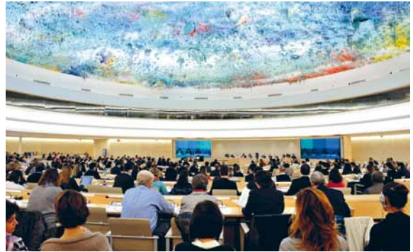
Session of the Human Rights Council in Geneva to review the human rights situation in Germany.

Another problem area is investigations into allegations of police brutality. The German government rejected the recommendation that it set up independent bodies to handle complaints of police brutality. Since 2009 other UN bodies, the Institute and civil society organisations have pointed out that there is a need for action in this domain. Only a small number of complaints result in an investigation, and even fewer cases ever lead to a conviction. You cannot just dismiss that by saying that most of the accusations were false. The reasons are far more complex: for example because of a misunderstood esprit de corps , police officers hardly ever testify against their colleagues. Moreover, it is often the case that the accused officer cannot be identified. Here, mandatory identification of the kind recently introduced in some German states would help.