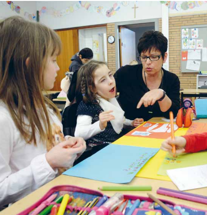
Inclusive learning as demanded by the UN CRPD, here in a primary school in Neuss.

tion. That includes entitlement to healthcare as well as to medical or professional rehabilitation, for example. The right of the disabled to adequate support plays a large role in the CRPD. The question is: what are the consequences for basic social security for older persons or those with reduced earning capacity?