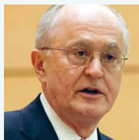
UN Special Representative for business and human rights John Ruggie

In the context of a process of due diligence, companies are to assess their internal working conditions, suppliers, business partners and transactions such as land purchases to determine whether they comply with human rights. The principles are based on voluntary commitments. To give them greater bind-