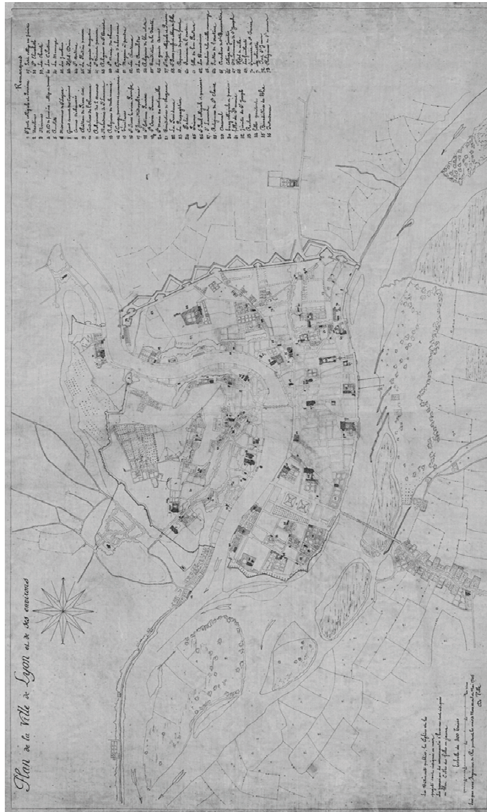
Figure 1: City Map of Lyon and its Surroundings, 1745