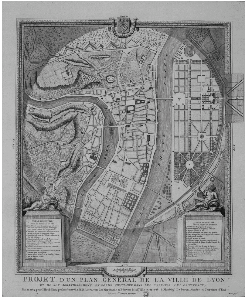
Projet d'un plan général de la ville de Lyon et de son agrandissement en forme circulaire dans les terrains des Brotteaux [1764], présenté à Monsieur, Frère du Roi, lors de son passage à Lyon, le 6 septembre 1775, 44 x 60 cm, scale: 1:9.000, etching.

Morand first presented his eastern expansion project – also referred to as “ville circulaire,” “ville ronde,” or “nouvelle ville” – in 1764 to the Hôtel-Dieu, and then in 1766 to the city council. The round form is clearly recognizable on the map, but as far as I know, Morand did not write a longer treatise justifying this form. The circle was the ideal form of the Renaissance city (Bramante, Filarete,