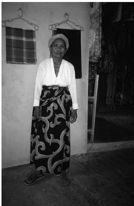
Plate 12.8 Maguindanao Muslim woman in traditional attire but with modern skirt design

idea that the head cover is prescribed by Islam. The men and women of the group called Islamic Studies Call and Guidance (ISCAG) believe they must conform to the dress requirement of Islam described as: 'loose but not tight, long but not short, thick but not thin and with a veil'. 29 The abaya fits this description since it is loose, thick and long. This also reflects the orientation of the ISCAG organisers who encountered Islam in the course of their employment in Saudi Arabia. They are converts from Catholicism, from the traditionally Christian areas in the Philippines, and did not share the ethnic characteristics and heritage of southern Philippine Muslims. Other Muslim women also took to the abaya since, as Mrs. Alonto, wife of former Senator and Muslim leader Domocao Alonto, said, it is more comfortable and easier to wear than the malong . ISCAG women, however, emphasised that their dress conforms to the Qur'anic verses that call for modesty.