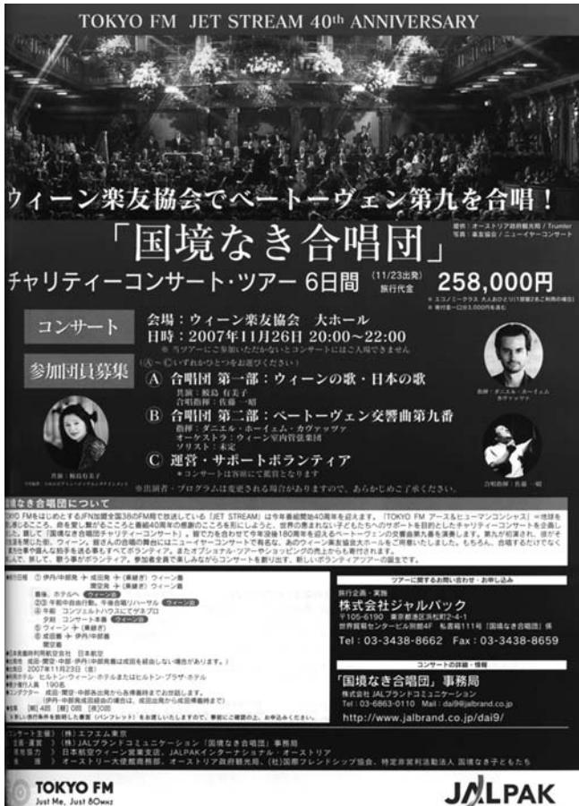
Plate 10.5 JAL's Borderless Choir Daiku in 2007, sponsored by Tokyo FM 67 (JAL 2007: 140)