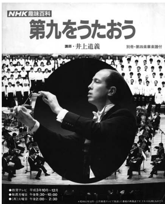
Plate 10.3 NHK's guide to the Ninth : Let's Sing Daiku

The term daiku also features on websites that introduce Japanese seasonal events, such as in Web Japan's NIPPONIA . The no. 34 edition of the web magazine introduced December events in Japan, featuring daiku as a major annual event (Web Japan 2005). 50 Another example is the site Japan Market Intelligence , which provides a report on Christmas time in Japan, describing the Ninth as the 'unofficial seasonal anthem' of Japan. 51 Meanwhile, Trends In Japan , part of Web Japan , goes further to give more details about the amplitude of the phenomenon with its Roll Over Beethoven: Japan Can't Get Enough of the Ode to Joy article in 2000. It is a comprehensive summary for anyone who wishes to get a quick glimpse of the phenomenon (Trends in Japan 2000). Such references to daiku or the Ninth are a clear indication that the phenomenon has become an indispensable socio-cultural element in modern Japan.