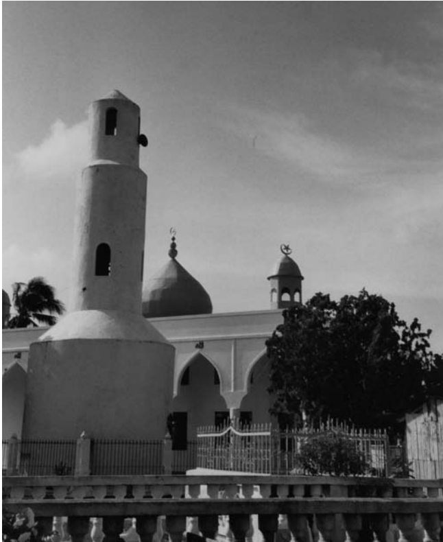
Plate 12.3 Tubig Indangan mosque in 2004

To Maranao Muslims, constructing a mosque is pious work and prominent Muslims feel they have an obligation to build a mosque for the community (Abbahil 1980: 97). Once established, even if largely unfinished, the mosque is not only a constant reminder of the religion 19 but also serves as an anchor for the community and as a symbol of Muslim presence in the area. The mosque is a gendered space. Islam does not require women to go to the mosque, but when they do, they are expected to conform to prescribed gender-based use of mosque space. Men occupy the front section of the prayer area while women are either behind the male congregation or in balconies overlooking the