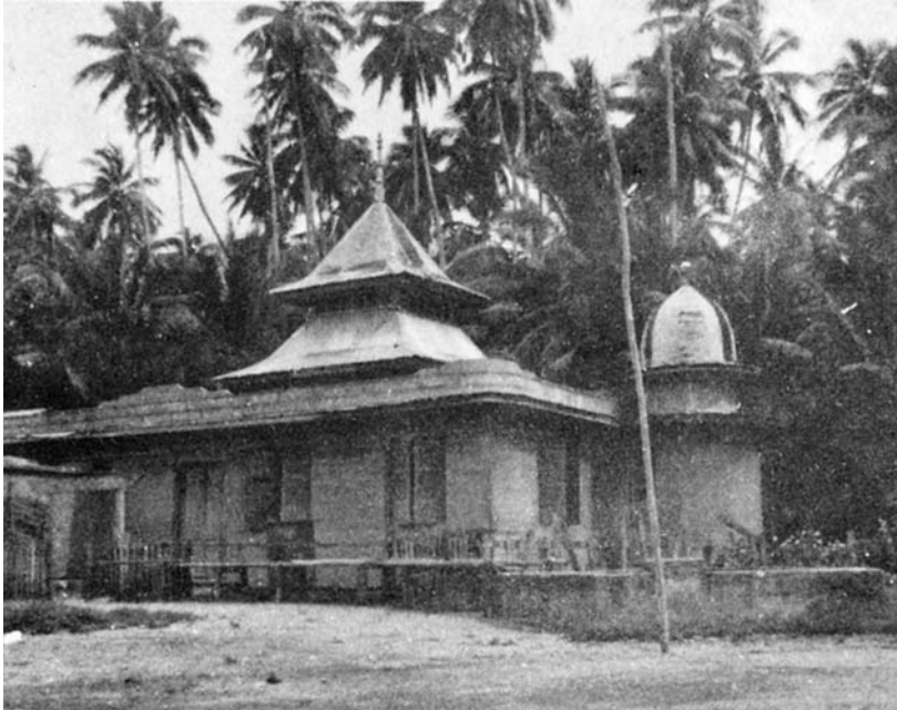
Plate 12.2 Tubig Indangan mosque in the 1960s

The Islamic City of Marawi 18 has the greatest number of mosques in the Philippines. Muslims in this city generally belong to the Maranao ethnic tribe and constitute about 92% of the city's population. Travel brochures boast of Marawi as the Islamic cultural centre of the Philippines. It has many Islamic schools where Arabic, Islam and the Qur'an are taught. The city's Mindanao State University houses the King Faisal Institute of Islamic Studies and the Zayd Ibn Thabit Qur'anic Studies Center. Mindanao State University is a public institution, but the presence of a mosque and the Qur'anic centre visually express the university's Islamic identity in this Islamic city. Most of the mosques in Marawi feature multi-domes and minarets. In keeping with the colours of the mosque of Medina, several mosques are painted white/cream and green, like the Bacolod Grande, Bacolod Chico, King Faisal and Gnassi