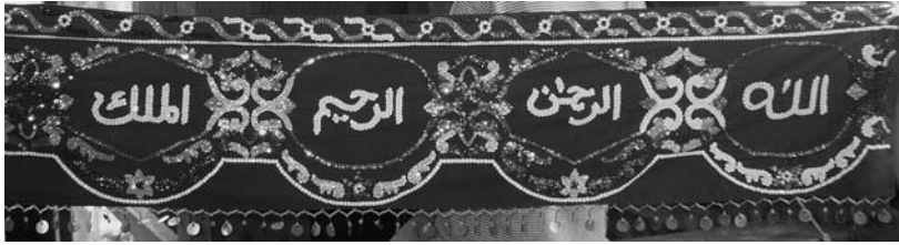
Plate 12.6 Ninety Nine Names of Allah