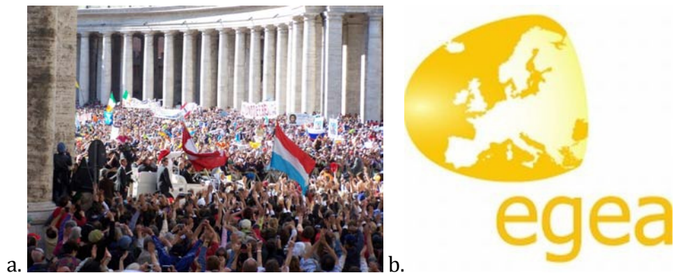
Figure 4. a.mass tourism at Vatican; b. Egea's logo

promote own languages, as Syria, where tourists go to learn Aramaic. In countries as Portugal and Pakistan the intercultural exchanges are encouraged in order to develop understanding each other, promoting the friendship relations between countries. In New Zealand, youth tourism is defined as that form of tourism that is practiced by the youths that visit a country with educational purpose, and who stay there less than a year. We can say that the main characteristics of the youth tourism are that it is practiced by people between 15-26 years old, it is a niche industry, it has an educative purpose, and it represents an international instrument of exchange, peace and tolerance. An example of youth association regarding traveling is EGEA (European Geography Association), that has a logo (Figure 4b), a website and a great community of young geographers.