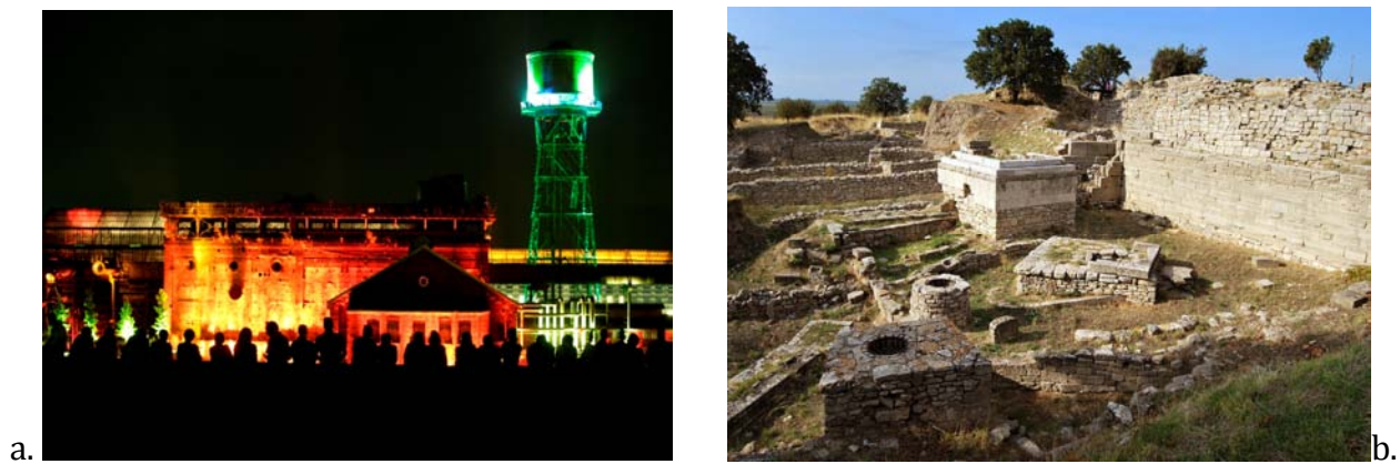
Figure 2. a.industrial tourism; b. site of Truva, Turkey

Another perspective on tourism as a resource is the scientific one- tourism as a scientific resource. Touristic interpretation [7], as a tool in managing touristic space and resources plays an important role. Through it, historic and archeological sites are evaluated, interpreted and arranged according with the touristic interpretation principles. The final goal of this actions is the reconstruction of a site- in the place of some stones, there is partially or integrally the objective. A good example is the archeological site of Truva in Turkey from Figure 2b (here are located the ruins of Homer's Troy). After rearranging the site according with the interpretation principles, the scientific resources became more complex due to the fact that they finally had a perspective on the site.