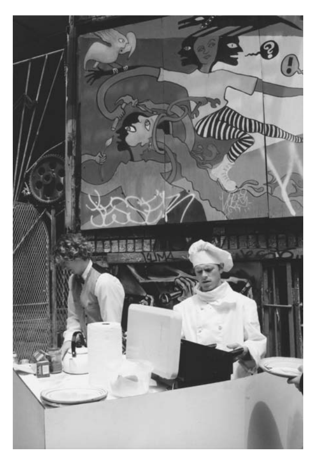
FIGURE 5 Nomadic Café serving free coffee and French toast, by the Providence Initiative for Psychogeographical Studies.

centrally by the organizers through a totalizing perspective that viewed players positioned on a map. It was also experienced from the perspective of individual pieces, immersed in the action and gaining only partial senses of events (Figure 7). Moments of insight as well as confusion, frustration and even recalcitrant behaviour were common. As Zack, playing black queenside knight recounts, 'The Black Queen rushes by on her way to c7 [Stanton and Orchard]. She ignores my attempts to initiate conversation.' Later: 'A Black pawn wanders by, eating an ice cream cone. He has yet to be given a single move, and questions his purpose.' Another pawn's static afternoon and mounting boredom later turned out to be caused by a faulty mobile phone, rather than the lack of attempts to move the piece.<sup>22</sup>