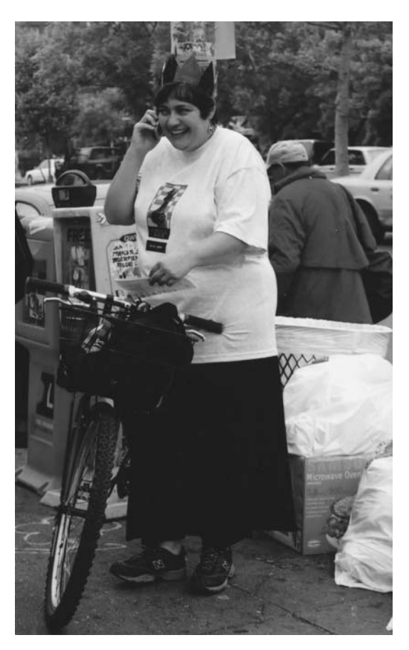
FIGURE 7 Receiving instructions on Houston Street during the human-sized chess match in New York City.

a more active stance is a primary focus for me.'<sup>23</sup> Another investigative project dispatched small groups of participants to explore and document the service entrances and backspaces of famous buildings. Organized by Margrethe Lauber, these groups focused on iconic structures such as One Times Square, the Empire State, the Rockefeller centre and the United Nations, but from angles that circumvented their well-known and much-photographed faces. Participants found themselves considering everyday routes that sustain the structures and yet are normally rendered invisible to 'ordinary' visitors. They were also confronted by architectural fortifications and security apparatuses – already well known, of course, to those who frequently find their movements deemed 'inappropriate', such as the homeless – through which the buildings channel 'appropriate' movements and otherwise repel the outside (Figures 8 and 9).