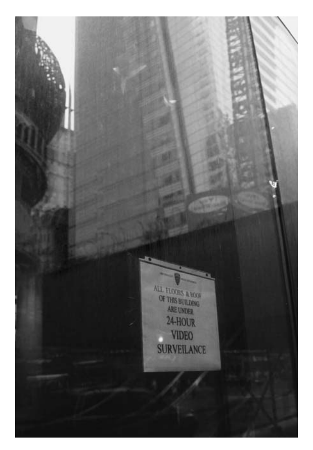
FIGURE 8 One Times Square, New York City, May 2003.

According to Ray, what connected the diverse events of the conflux was a shared concern with what she referred to broadly as 'the meaning of living in a city'. <sup>24</sup> But as the above projects suggest, this wide remit should be understood not only as referring to meanings as currently understood but also to questioning those meanings, to displacing habitual modes bound up with work and leisure so as to rediscover the spaces, situations and activities that constitute urban living. Games, walks and events encouraged participants to adopt different routes, or sought to defamiliarize routine paths and practices. Standard components of the day such as the time spent on the commute could, as in Karen O'Rourke's project 'New York body 'n' soul map' in 2003, take on new meaning through becoming the focus of story-telling and through the accumulation and mapping of details. Her project called out to local residents: 'Send us your tiresome commutes, your everyday errands, your shopping sprees and secret shortcuts, your wrong turns, bike rides and bus routes. Write your paths through the city and we'll map them for you.' Mapping and