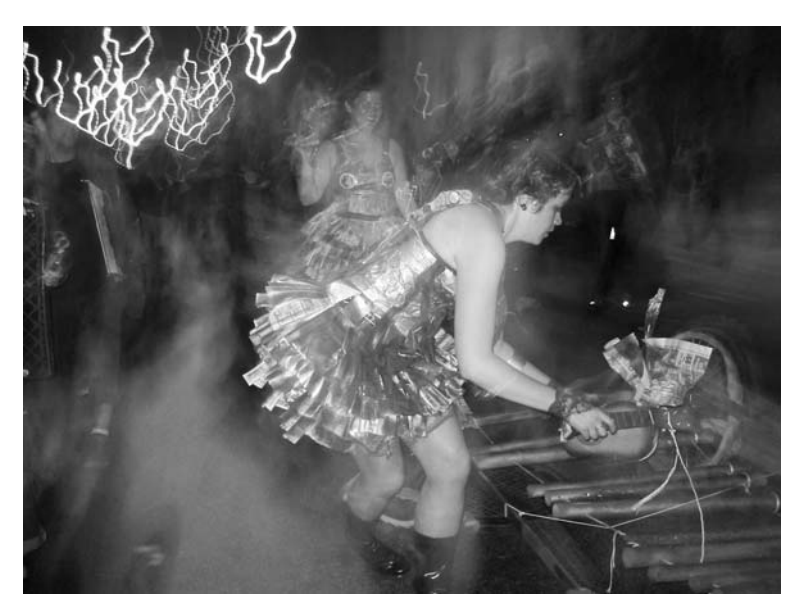
FIGURES 1 AND 2 Toyshop's Serenade, East River Park, New York City.