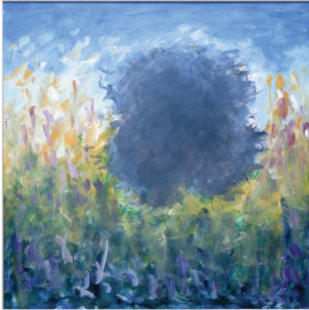
FIGURE 1 Morning sight, Ann Roughton. (Permission courtesy of the artist.)