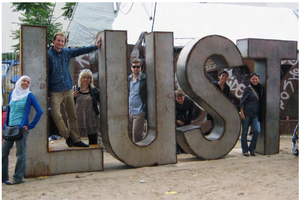
Participants explore Berlin and its art works ...

After lunch, the group walked through Berlin's Tiergarten to the Federal Chancellery for a tour of the building and a short briefing. They learned about the institutional set-up, the history and the work of the Chancellery, German foreign policy priorities and objectives and even about the marvelous art that is found throughout the building. The evening finished in a convivial atmosphere with dinner and variety theatre complete with popular music and dancing at the TIPI Zelt am Kanzleramt.