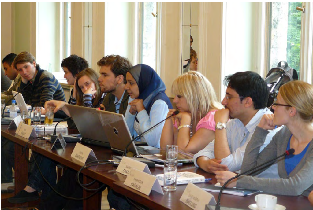
Participants discussing in DGAP's Robert Bosch Saal, the lecture hall of the Summer School