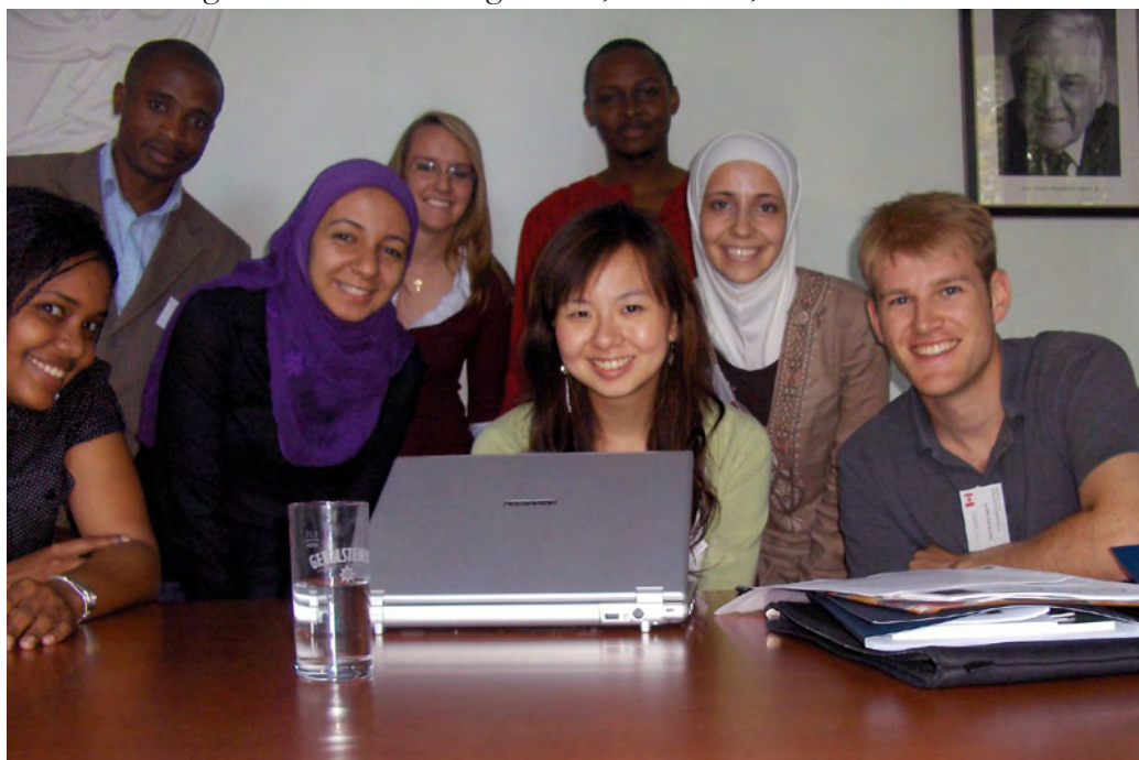
Relief and smiles after finishing the work in the Africa group

It is from this starting point that our research paper addresses the issue of regional leadership in Africa. And an appropriate starting point it is, because the problems of Africa are easier to conceptualize if we see the continent as a collection of distinct regions. While these regions do, of course, interlink with each other