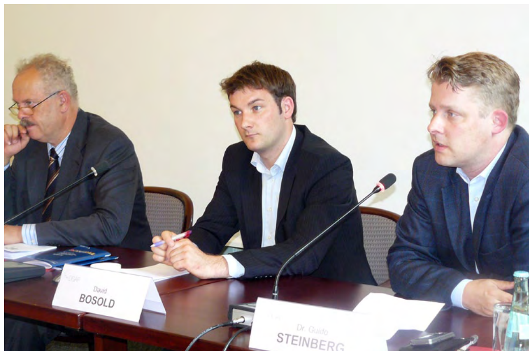
Miroslav Gregorič and Guido Steinberg address the challenges of WMD and terrorism

H. E. Urmas Paet, Minister of Foreign Affairs, Republic of Estonia