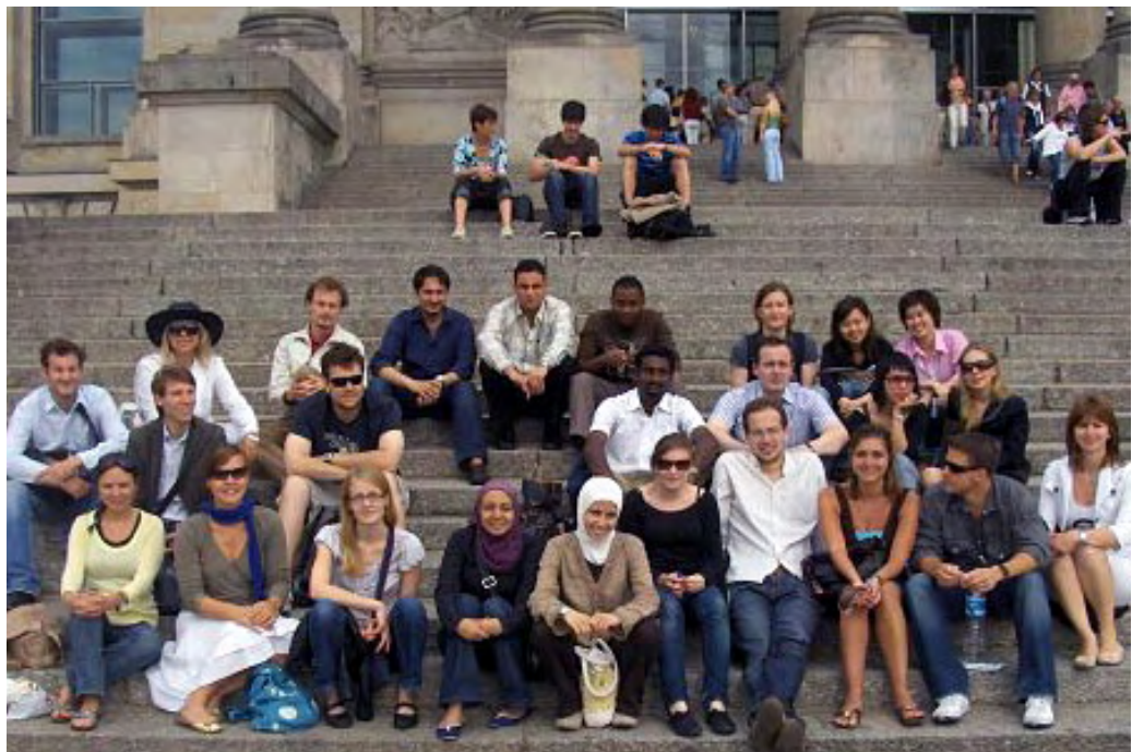
The group in front of the Reichstag, the seat of the German parliament