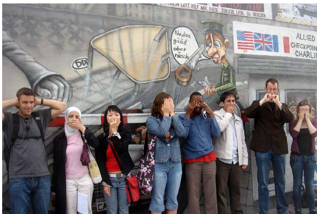
... and discover the largest remaining piece of the Berlin wall: the East-side Gallery