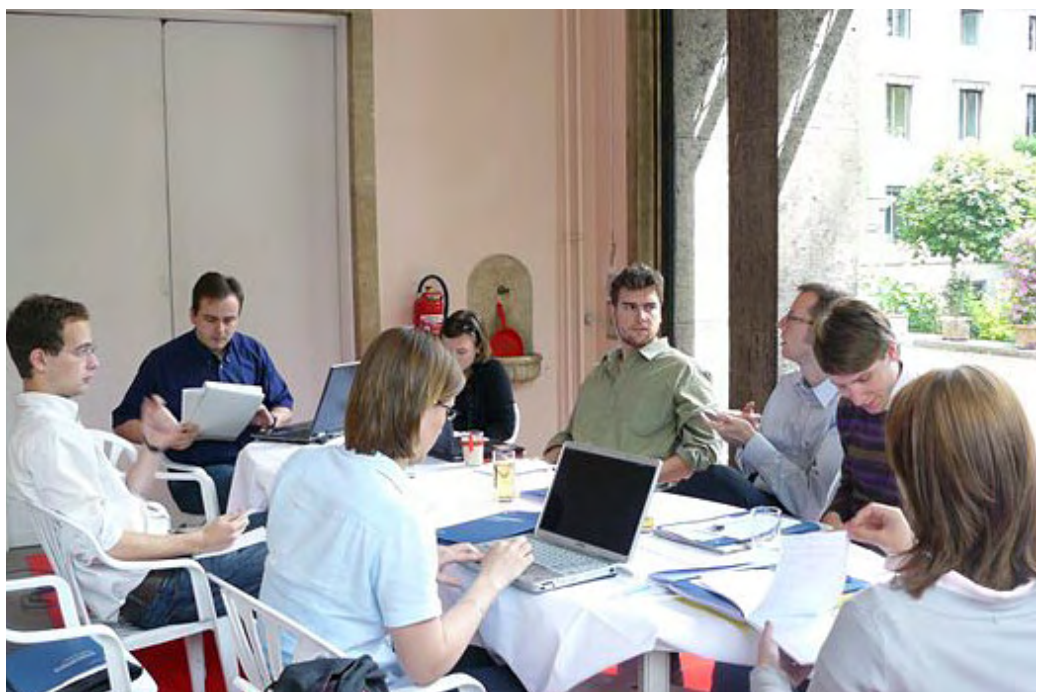
The Europe Working group debates in the DGAP's winter garden.

In certain areas the interests of these regional leaders are conflicting. The issue of democracy promotion is the most obvious example in this regard. Russia poses no immediate security threat to the EU, however, and if as stipulated by the ESS, democracy promotion is understood to serve pragmatic interests rather than ideological ones, the EU could make a case for dealing with Russia as it is. Russian influence on the global stage—for example in the UN Security Council—certainly hampers