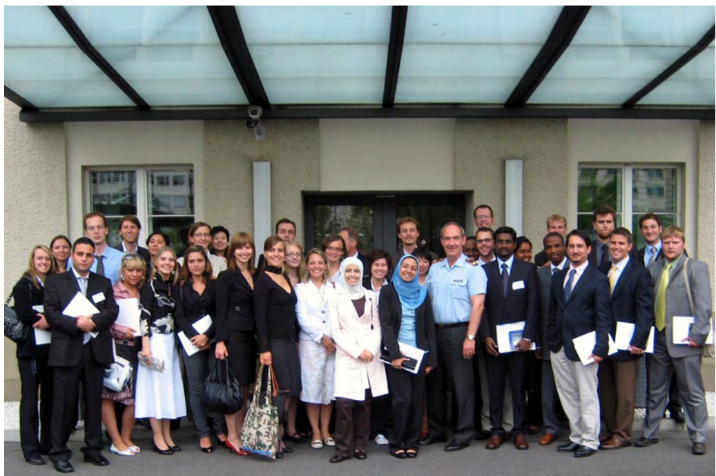
The group visits the Federal Ministry of Defense