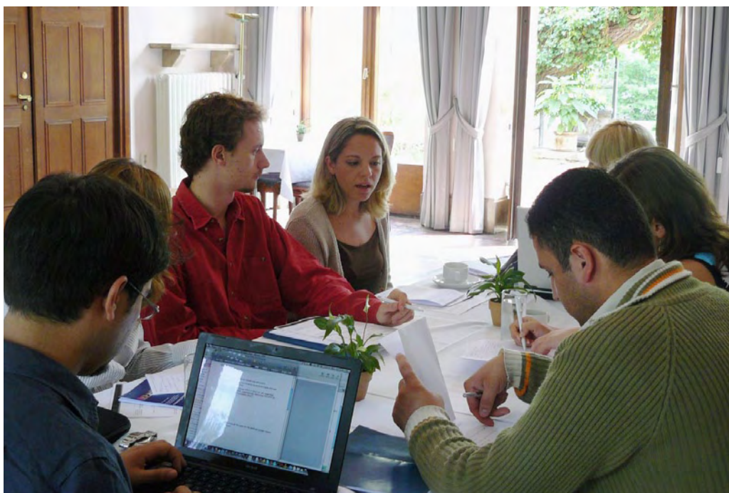
Intense preparations for the MENA group's policy paper

Hence, dynamics in this sector enhance the role of external actors. The US plays a significant role. Oil-producing states would increasingly have a lot at stake in prioritizing US foreign policy in the region. And since the US has strong economic interests in the region, it consequently provides significant financial as well as military and political support to some governments and strives to isolate others. Such actions, combined with the US lack of confidentiality in the region, have caused an inferiority complex to develop in the Middle East and North Africa. By