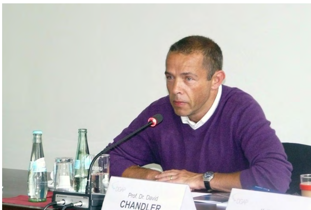
Professor Chandler critically engages with current state-building agendas