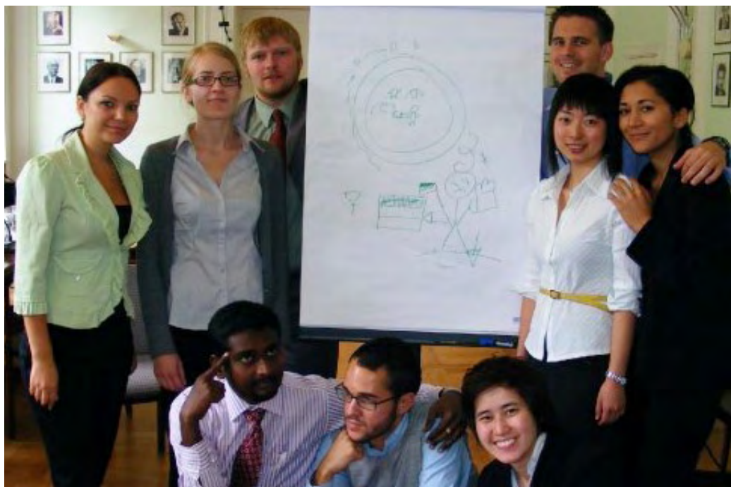
Contemplating regional leadership in Asia and learning from each other ...