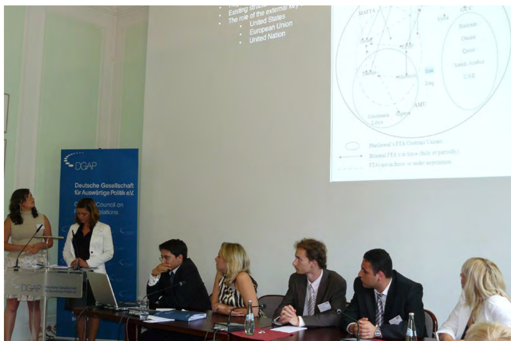
Complex regional security complexes in the Middle East

The applicability of multilateralism in the MENA region (or the interest in multilateralism among MENA nations) remains questionable, since classical rivalry among countries exists and three groups of tension can be identified: Iran vs. the Arab world, Israeli vs. Palestine, and rivalry among Arab states. In the 1960s, radical Arab regimes contested the legitimacy and power of traditional monarchical states. In the 1970s, Islamic fundamentalists rejected the prevailing secular order and sought to set the region on the path to God. In the 1980s, much of the Arab world supported the genocidal Saddam Hussein as he sought to displace Iran’s theocratic regime. Today, MENA is fracturing once more, this time along sectarian and confessional lines, with Sunnis clamoring to curb Shiite ascendancy. Furthermore, bilateral treaties between countries in the region and between MENA nations and the United States have been seen as much more relevant than multilateral cooperation. In this system of disunity, each state places its domestic interests before regional or sub-regional interests, which then results in the malfunctioning of private and public regional and sub-regional organizations. The mentioned rivalries also make the emergence of a regional power impossible, since a regional leader should be accepted within the region and enjoy international credibility and support. (...)