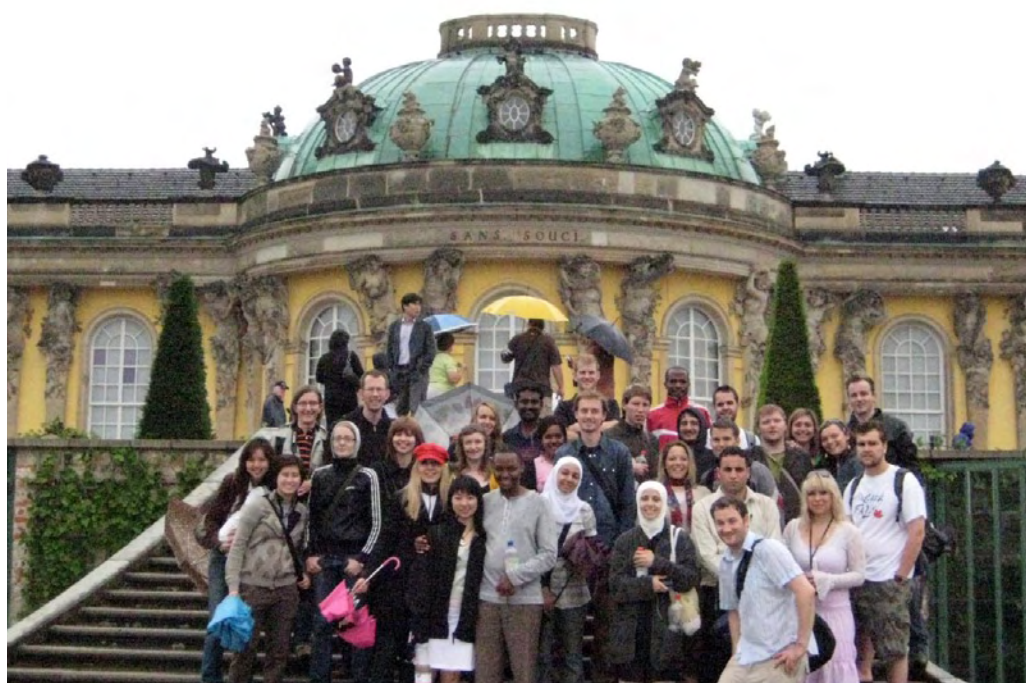
With rain, but sans souci: Participants enjoy the trip to Potsdam