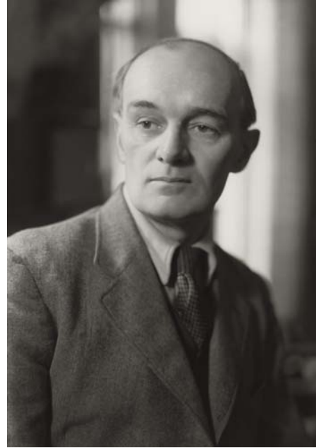
Thomas Humphrey Marshall (1893-1981)