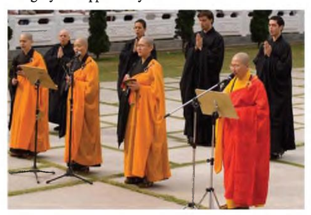
Recitation at the Zu-Lai Temple in São Paulo

If one generalizes the well-documented statistical decline of ethnic Buddhism in Brazil over the last decades and suppose that other countries have witnessed similar dynamics, then only a relatively small proportion of the enlisted Mahayana-Buddhists should be taken as an indicator of the current relevance of ethnic Buddhism in South America. On the other hand, besides more than eighty ethnic-based Shin-Buddhists communities, there is a series of ethnic Buddhists communities in the region. In this context there are traditional Zen institutions with a strong ethnic background such as the Busshinji Temple in São Paulo and Daishinji Temple in Bogota. Another example is the Tzong Kwan Temple in São Paulo, built with the extensive financial help of the Taiwanese order and the local Chinese community, and which served after its inauguration by the Buddhist master Pu Hsien in 1993 as a model for the construction of two "sister" institutions, one in Argentina the other in Paraguay.<sup>22</sup> In a similar category falls the Fo Kuang Shan-order whose religious activities in countries such as Brazil, Chile, Argentina and Paraguay are supported by local Chinese communities.