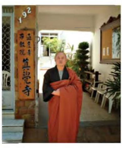
Minister of the Jin Kak Temple in São Paulo

idea of the East and particularly of Japan constructed by the early writings of Brazilian philosophers, novelists, poets, and historians