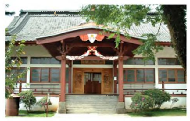
Tendai-Temple in São Paulo, Photo: Rafael Shoji (2004)

The general statistical strength of the Brazilian Buddhist institutions is reflected in a numerical overweight of certain Buddhist branches. This is true for Amida Buddhism represented in South America by eighty-four temples of which 90% are located in Brazil. Another example is the New Kadampa Tradition with followers in Brazil (more than twenty centers) and in Chile (three local institutions). More striking is the situation of Buddhist branches restricted to Brazil as in the case of Honmon Busuryushu (eleven institutions), Shingon (five) and Tendai (two).