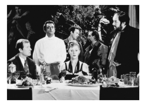
The Cook, The Thief, His Wife and Her Lover

faction about this medium and its history: "Just now that cinema celebrates its first centenary and is a medium ripe for the re-invention of itself, there is evidence to believe that all art moves towards the condition of film."<sup>4</sup> If the "birth" of the cinema more or less coincided with the height of European Wagnerism, when Walter Pater could claim that all the arts aspired to the condition of music, and Stéphane Mallarmé – apparently contradicting, but in fact merely refining this