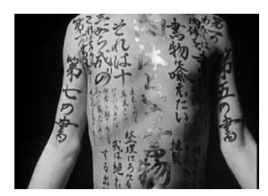
The Pillow Book

He wants to turn the separating wall, the protective skin and delicate membrane that is the gallery outwards, in order for the city itself to be experienced as an intimate space. What he wants to reach via the gallery is the city, sites and places that are public, because already traversed by different kinds of audiences, forming instant, transient and transparent communities – shoppers, strollers: "a man taking a dog for a walk, a dog biting a man, a man biting a dog."<sup>30</sup> Greenaway has denounced the pseudo-community of today's cinema attendance, averring that even television scores higher as a form of sociability. It almost seems that he has decided that there is no point in making (European) cinema, unless one understands what it is that creates not just audiences – "audiences ... the watchers watched" – but sociable or public audiences, even under the conditions of the "society of the spectacle."