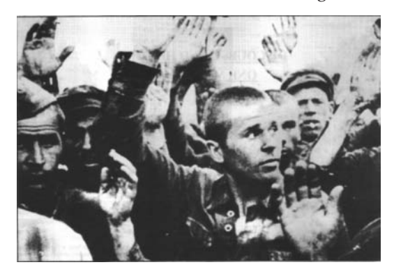
One Man's War

Yes. As far as documentary is concerned, I always feel that fiction films are the best documentaries of any period for they allow the imaginary to speak, which in the bad sense of documentary is forbidden.