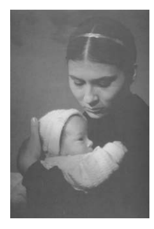
GERMANY PALE MOTHER

hinted at, its other export to the US in the 1970s and 1980s were narratives and images of its national disaster. The New German Cinema became critically successful and culturally significant when it began to "represent" its terrible history in the form of stories about Nazism and the war. Virtually all of the films still remembered from the New German Cinema have this twelve-year period and its aftermath as their direct or indirect topic (THE TIN DRUM, OUR HITLER, THE MAR-RIAGE OF MARIA BRAUN, LILI MARLEEN, THE GERMAN SIS-TERS, GERMANY IN AUTUMN, THE PATRIOT, THE POWER OF FEELINGS, GERMANY PALE MOTHER, HEIMAT, and WINGS OF DESIRE). We may think this is because of the quality of the films or the gravity of the subject matter, but in the US it is Nazism that carried a special recognition value for the signifier "Germany" within popular culture. It has been and still is a taboo-breaking, transgressive signifier, emotionally, ideolo-