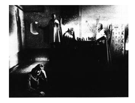
The Hypothesis of the Stolen Painting

A wholly imaginary world comes into being which owes little to reality or fiction, and much to the cinema's power to conjure up presence from absence. The philosophy implicit here evidences a total skepticism about cinema's supposed realism. In one tableau , the voice-over commentary points out that respect for the