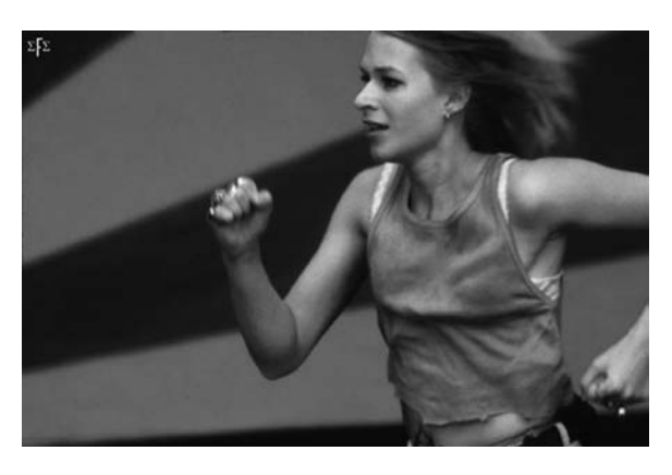
Run Lola Run

otherwise he's dead. Three times we see her start on her "race to the rescue," each time one slightly different micro-incident radically changes the course of events. The first time she arrives too late and Manni is killed by the police, the second time, she is killed trying to shield him, and the third time, she arrives in time, and Manni himself has found the money he had lost to a tramp. It is like winning the jackpot in a computer game that re-sets itself after each bout, but here balanced by the agonized pillow-talk between Lola and Manni separating the segments: "Why do you love me? – Why me?" Lola asks, to which Manni