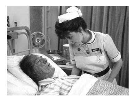
THE SINGING DETECTIVE

of boyhood anguish and emotional confusion around sex, death and domestic violence. For THE SINGING DETECTIVE coheres not so much around the various incarnations of Phillip Marlow now, then and as his own wish-fulfilling projection, but around the incomplete identification of a boy with his father – this time a weak, ineffectual one – in order to work out erotic ambivalences towards the mother – this time not victim of male violence but sexually active temptress and femme fatale. It may be argued that Potter uses this version of the Oedipal trauma (with the