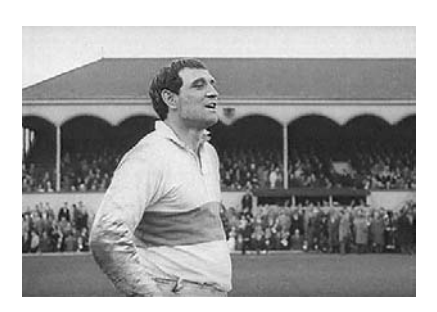
This Sporting Life

British cinema celebrates its renaissances with such regularity because it always functions around another polarization – what one might call an "official" cinema and an "unofficial" cinema, a respectable cinema and a disreputable one. The renaissances always signal a turning of the tables, but only to change places, not the paradigms. Official: Basil Dearden, Noel Coward, David Lean; unofficial: Powell/Pressburger, Gainsborough melodrama. Official: Ealing co-