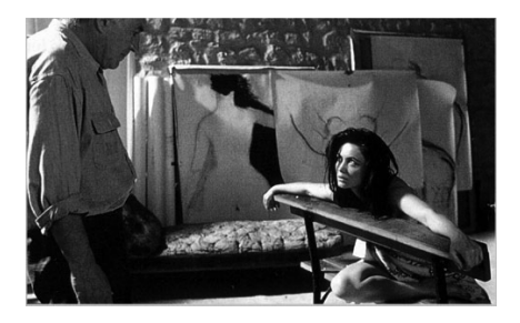
LA BELLE NOISEUSE

Ultimately, it is this capacity to be a "realist text" and allegorical at the same time that makes LA BELLE NOISEUSE contemporary, and to my mind, an "intervention" rather than a conservative restatement. One might cite Borges and Roland Barthes: Rivette is re-writing a classical (readerly) text as an allegorical (writerly) text. As in the case of Barthes most famous allegorical rewriting of a realist text, Balzac's novella Sarrasine in S / Z , so the realist text of Rivette is also a novella by Balzac, Le