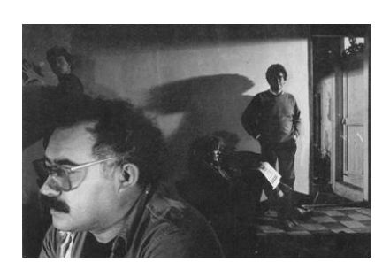
On Top of the Whale

HIGH SEAS is a Franco-Dutch co-production. By another deliberate and perhaps provocative irony, the French contributions – the director and the male star – are thus an Argentinian and a Pole. INA will mainly act as distributor in France and also hold television rights. All the other actors and the crew are