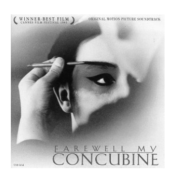
FAREWELL MY CONCUBINE

Together with the winners of Cannes, Venice, Berlin, the Miramax titles thus constitute the season's mini-hits (or "indie blockbuster"), and they often do so, on a global scale, for a world public.<sup>21</sup> For just as one finds the same Hollywood movies showing in cinemas all over the world, chances are that the same five or six art cinema hits will also be featured internationally (titles like TALK TO HER, LOST IN TRANSLATION, ELEPHANT, THE FAST RUNNER, NOBODY KNOWS) as if there is, with respect to cinema, only one single global market left, with merely the difference in scale and audience distinguishing the blockbuster from the auteur film or "indie" movie. The latest medium budget European film will, along with the latest Wong Kar-wai draw – after due exposure at Venice, Cannes,