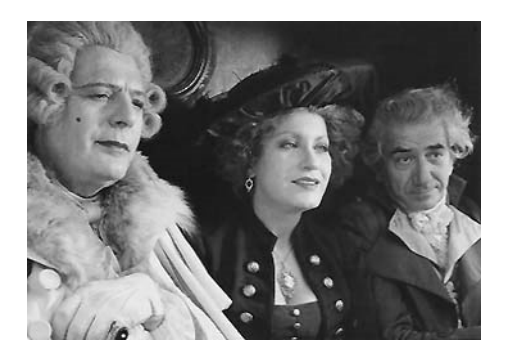
That Night in Varennes

And yet, history is made that night: there is a Revolution in Scola's film. It is not about politics, but about sex, and not about the Rights of Man, but the rights