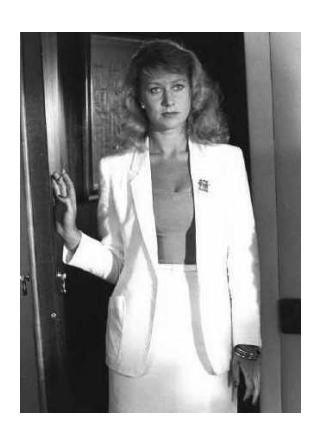
The Long Good Friday

ing class males, violent and articulate, working class women, sexy and self-confident. No one would mistake this as realistic, yet the films that fit the scheme range from LETTER TO BREZNEV to THE DRAFTSMAN'S CONTRACT, A PASSAGE TO INDIA to THE LAST OF ENGLAND, MY BEAUTIFUL LAUNDRETTE to ANOTHER COUNTRY, THE LONG GOOD FRI-DAY to EDUCATING RITA. Most of these images of Britain sell better in Birmingham, Alabama than Birmingham, West Midlands, because they encapsulate what "we" try to sell to "them." But on closer inspection, one sees the films that did well in both places, whether coming from the "official" or the "unofficial" cinema, gave the myths a special edge, mixed the stereotypes in unexpected ways, or enacted the cliché to poignant perfection. Thus, they released a rich cultural sediment of meaning by which mem-