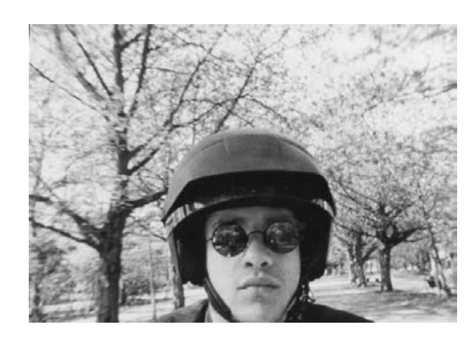
Amsterdam Global village

Perhaps I can illustrate what I mean by the more benign, symbolic and discursive forms that double occupation can take, with a scene from a documentary by Johan van der Keuken, AMSTERDAM GLOBAL VILLAGE (1996). By following the delivery rounds of a courier on a motorcycle, the director follows the lives of several immigrants who have made their life in Amsterdam: A businessman from Grosny, a young kickboxer from rural Thailand, a musician from Bogota who works as a cleaner, a woman discjockey from Iceland, a photographer,