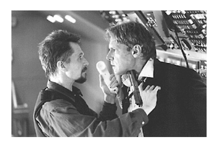
AIR FORCE ONE

Possibly realizing the artistically productive, but economically crippling, miscognitions in this self-understanding of a national or auteur cinema in a rapidly globalizing environment, a segment of Germany's filmmaking community turned away from such tormented love-hate relationships with Hollywood in the mid-1980s. Instead, they transformed the encounter with an imaginary America, mirroring an introspective and retrospective Germany still in thrall to