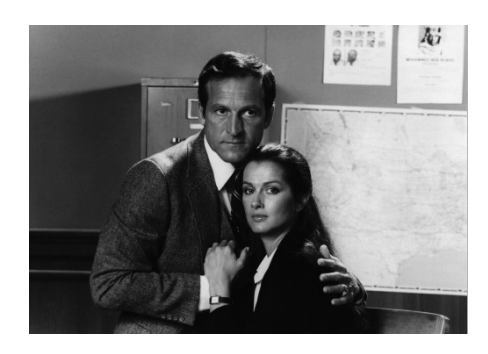
HILL STREET BLUES

With the demand for ever more finely calibrated categories of viewers, however, the rating system has itself entered a crisis and may eventually give way, as the gold standard did, to a more fluctuating and uncertain "exchange rate mechanism," with a "speculative" viewer economy of television in the global context existing alongside the old "ratings wars."<sup>18</sup> In the speculative economy, prime time programs, expensive to make but with a mass-market audience ( Dallas, The Cosby Show ) compete with quality programs for highly defined minority