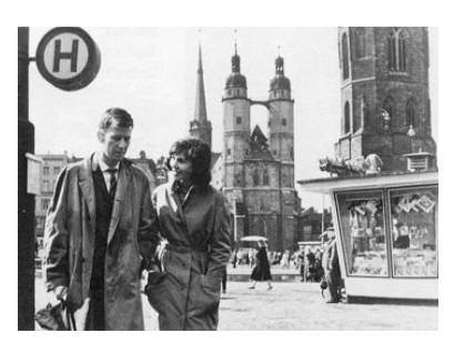
Der geteilte Himmel

In speculating about the possible reasons for the controversies the film provoked, it may be of significance that these centered not on the hot topics of Republikflucht and the national divide (after all, quite a few films were made in the GDR about the wall before DER GETEILTE HIMMEL), but concerned the film's formal characteristics and its difficult, avant-garde mode of narration. Indeed, it makes