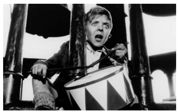
The Tin Drum

West Germany's cinephile identity formation around oedipal paradigms was broken up with the screening of the US-television series Holocaust in 1978 and 1979. Such was the shock at discovering American television "appropriating" the German subject par excellence that the New German Cinema "responded" with films by Volker Schlöndorff (THE TIN DRUM), Kluge (THE PATRIOT), Syberberg (HITLER -A FILM FROM GERMANY), Fassbin-