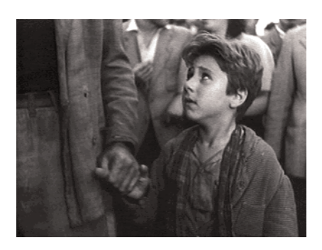
THE BICYCLE THIEF

If this is now a commonplace about Hollywood, it is just as true for European art cinema. The qualities for which filmmakers were praised were not necessarily what the audiences liked about their films, and what made them famous was not always what made them successful. In the case of Italian neo-realism, for instance, the aesthetic-moral agenda included a political engagement, a social conscience, a humanist vision. Subjects such as post-war unemployment, or the exploitation of farm labor by the big landowners was part of what made neo-realism a "realist" cinema, while the fact that it did not use stars, but faces from the crowd made it a "poetic" cinema (to come back to Weightman's comments on Ingmar Bergman). Yet as we know, a film like ROME, OPEN CITY (Roberto Rossellini, 1946) which is ostensibly about the bravery of the Italian