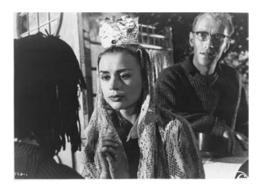
Through a Glass Darkly

By making this dialectic of visceral impact and spatial restraint both the center and the structuring principle, Bergman had, in my judgment, created especially with PERSONA a uniquely modernist film, where the modernist topos of appearance vs. reality found itself explored across that specifically cinematic mode of meaning-making we call "violence," which is not necessarily the violence on the screen, but the always implied violence of the screen. It gave PERSO-NA a different kind of vantage point, for it made an appeal to this fundamental tension of the cinema as a medium of reflection across an assault on the senses, in order to give thematic substance and formal coherence to the logic of its