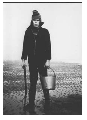
THE FLAT JUNGLE