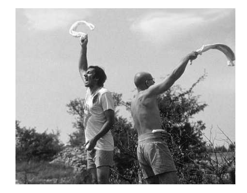
No Man's Land

with the victims ("imaginary identification"), and by making the victims "perform" their victimhood for the camera, the camera reproduces in this gaze upon them also the distance of that gaze (the "symbolic identification"), which is to say, the hidden knowledge that – as victims – these Bosnians (or whoever) pose no threat, make no demands, stake no claims (political, economic, religious) other than that of being treated as victims, which automatically reconfirms the West's position as benefactor, i.e., secure and powerful enough to