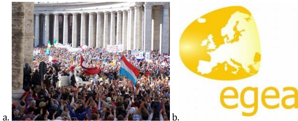
Figure 4. a.mass tourism at Vatican; b. Egea's logo

promote own languages, as Syria, where tourists go to learn Aramaic. In countries as Portugal and Pakistan the intercultural exchanges are encouraged in order to develop understanding each other, promoting the friendship relations between countries. In New Zealand, youth tourism is defined as that form of tourism that is practiced by the youths that visit a country with educational purpose, and who stay there less than a year. We can say that the main characteristics of the youth tourism are that it is practiced by people between 15-26 years old, it is a niche industry, it has an educative purpose, and it represents an international instrument of exchange, peace and tolerance. An example of youth association regarding traveling is EGEA (European Geography Association), that has a logo (Figure 4b), a website and a great community of young geographers.